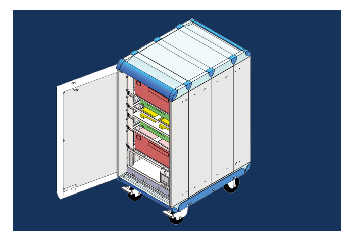
3-D drawing of HeiCase on rollers and interior configuration with open front door